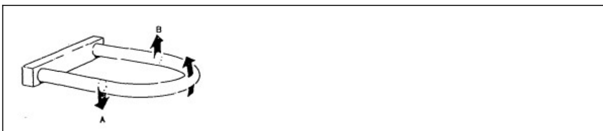
Figure 2: Reactive forces exerted by the fluid

Electronic densimeters operate according to the vibrating measuring tube principle (fig. 1): the fluid is introduced into a U-shaped tube and subjected to electromagnetic excitation (fig. 2 and fig. 3).