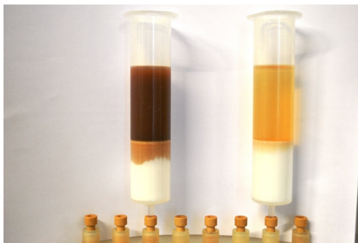
Figure 1 □ Example SPE extraction

where BC is the value of the blank measured after SPE (see 4.5).