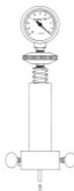
Figure 2 Aphrometer for stoppers

Remarks concerning the manometers that equip these two types of apparatuses: