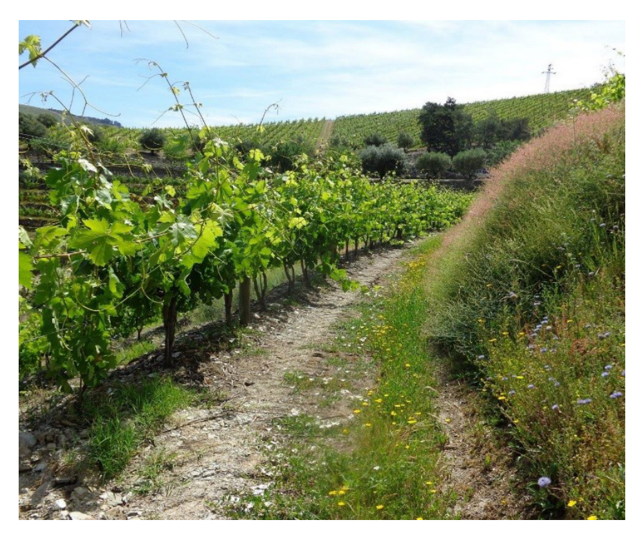
Picture.1. - Example of a vineyard installed in one row terrace with high diversity found on banks. In this case, the banks serve as an internal EI of the vineyard and face the grapevines at very short distance. (Douro, Portugal.).

Although ground cover of vineyards are usually not considered as part of the EI surface (cultivated area), a plant species rich green cover and its appropriate management is the pre-requesite for a diversified beneficial fauna in the vineyards, as it also causes considerable modifications in the microbiota inhabiting soils (Burns et al. , 2016). A high potential for a species rich and natural green cover has been found in slopping vineyards with small-scale terraces, as reviewed by Böller et al. (2004). In fact, by concentrating fertilizer input and mechanical impact (mowing, spraying, harvesting) in the horizontal alley, the steep banks can remain largely undisturbed and flora can be converted into a plant community similar to that in meadows with low management intensity. This plant community contains several perennial plant species of value in fostering beneficial parasitoids (Picture 1).